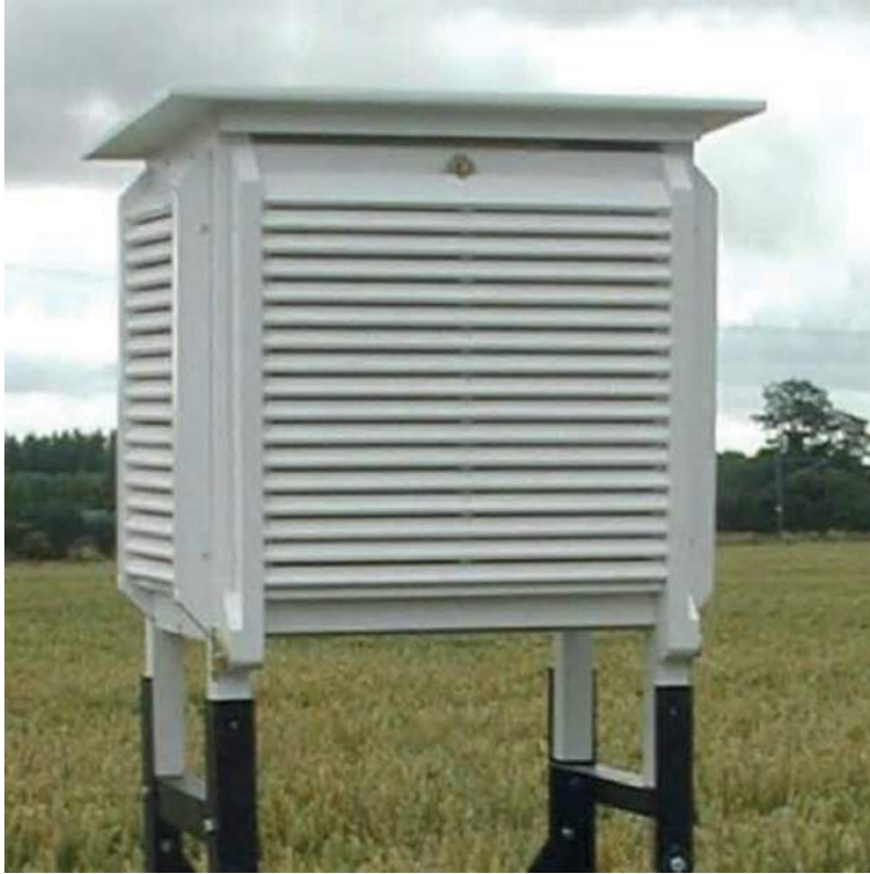
Photograph A for Question 1